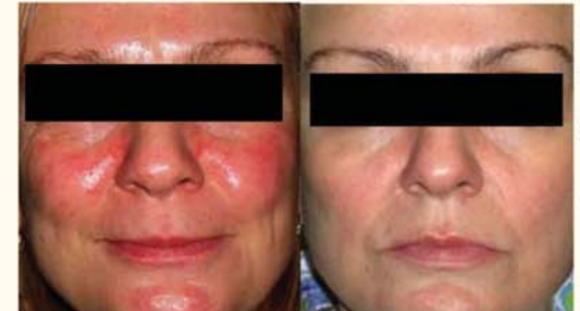
Patient treated with Photo Genesis and Laser Genesis

Most lasers treat only one or two aging conditions. They may diminish red or brown spots; they may just reduce lax skin. Only 3D Skin Rejuvenation from Cutera addresses all of the most common conditions of aging - age spots, sun damage, fine lines, wrinkles and lax skin.