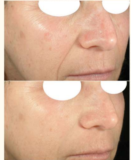
Patient treated with Photo Genesis, Laser Genesis and Titan